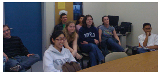
Club members enjoying a mathematics talk on "Finite Markov chains"

http://www.facebook.com/home.php?ref=home#/group.php?gid=8994248324