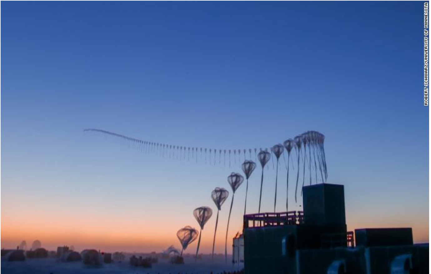
Picture Caption: A timelapse of weather balloons used to measure ozone.