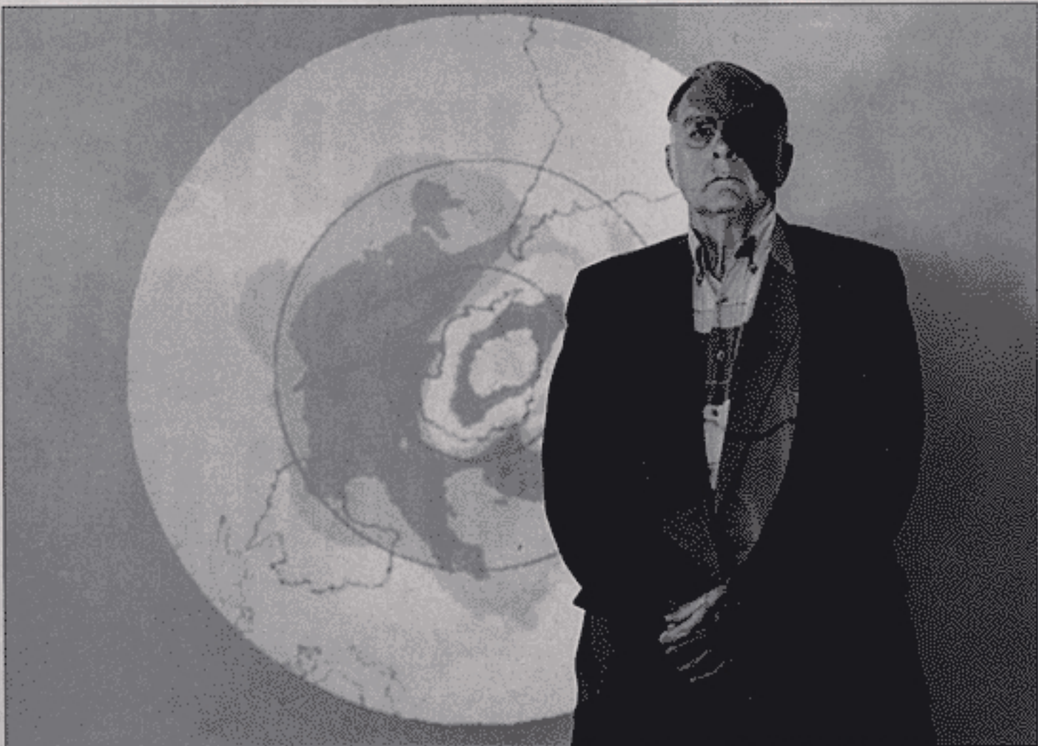
A F. Sherwood Rowland warned 18 years ago of ozone depletion that eventually resulted in the Antarctic hole (projected above).

During the winter, wind patterns called polar vortices hold cold air above the poles. Tiny ice crystals form in the air, which help convert chlorine from CFCs into molecular chlorine. In early spring, sunlight decomposes chlorine, setting off a chemical chain reaction. Each chlo-